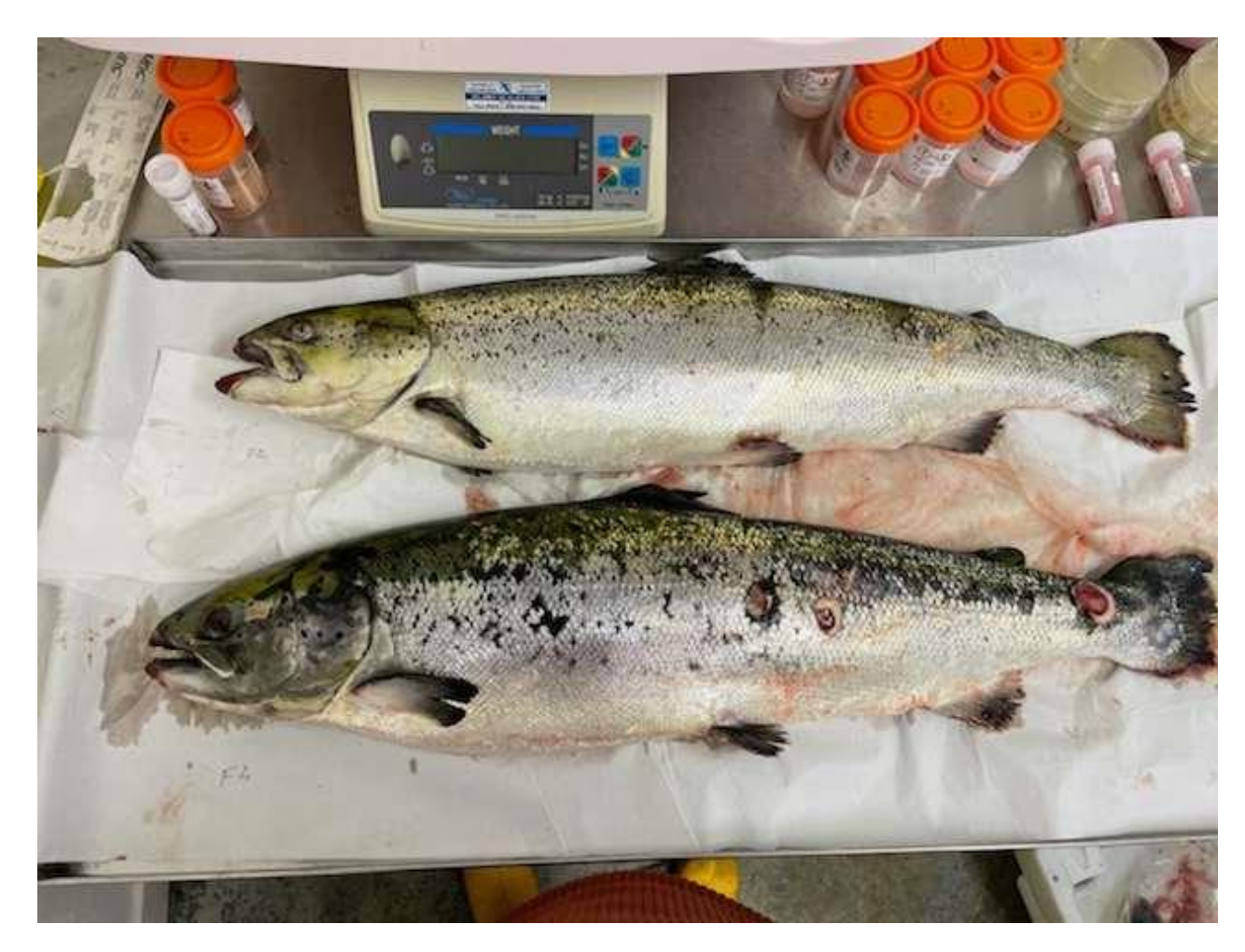
Fish 2 and Fish 3